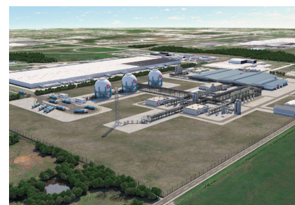
Illustration of the proposed hydrogen project H2OK in Oklahoma, North America. Conceptual only, not to scale.

Woodside's key growth projects include the Shenzi North and Mad Dog Phase 2 expansions of the currently producing US Gulf of Mexico oil projects. We also have optionality for other growth projects including the Trion greenfield development.