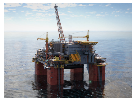
New Scarborough offshore floating production unit.

Woodside, as operator of the Scarborough Joint Venture, is developing the Scarborough gas resource through new offshore facilities connected by an approximately 430km pipeline to the second LNG train (Pluto Train 2) at the existing Pluto LNG onshore facility. Scarborough is targeted to deliver its first LNG cargo in 2026.